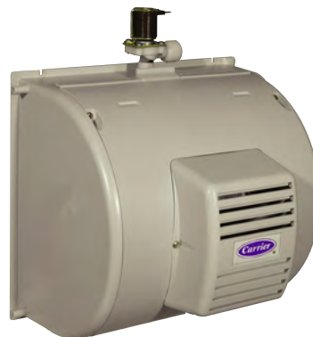
Model SFP Humidifier