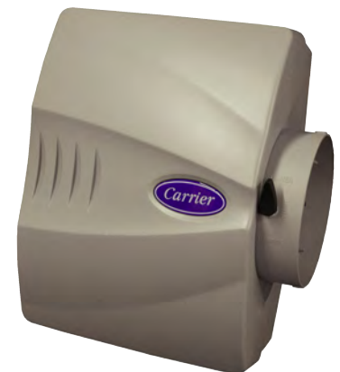
Model SBP Model LBP Model WBP Humidifier