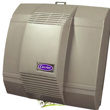
Model LFP Humidifier